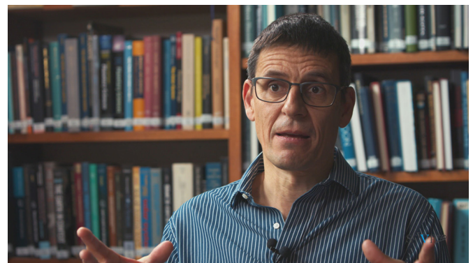
Figure 1 | Prof. Didier Queloz, Professor of Physics, Cavendish Laboratory.

We have a very detailed theory that is working pretty well to explain the formation and nature of our own system. 18 We have a lot of data on the planets of our Solar System, including remnant bodies from the early Solar System, which sometimes fall on Earth as asteroids. 19 There are lots of elements that we can put together. We know the atmospheric composition of at least one giant planet in the Solar System. 20 We have a good understanding of the telluric planets, maybe not Mercury, which is not very well-known.