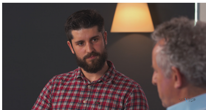
Figure 4 | “It is really interesting that the same process that prevents doping also allows you to not to need doping.”, L. M. Pazos-Outón.

LMPO: What do you think that is actually helping to passivate the defects?