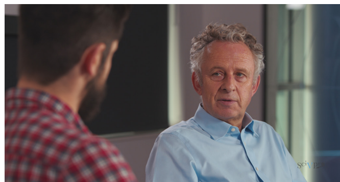
Figure 3 | “We tend at the moment to concentrate more on the pure material. As the field becomes more developed, we will pay more attention at what happens at the interfaces.” R.H. Friend.

LMPO: To achieve a very high luminescence you certainly benefit from having very low trap densities and low Shockley-Read-Hall (SRH) recombination rates, but also having a very strong radiative rate is beneficial. 85 Do you have any explanation of why the radiative rate is so strong?