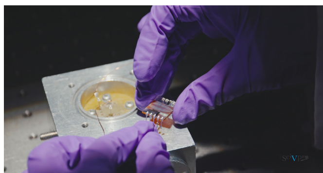
Figure 1 | Cs 0.5 (MA 0.17 FA 0.83 ) 0.95 Pb(I 0.83 Br 0.17 ) 3 interdigitated back-contact (IBC) perovskite solar cell.

Due to the incredible amount of impurities and structural defects caused by solution processing, polycrystalline perovskite films have a very high trap density ( \sim 10^{16} cm -3 ). 34,36,37 If you look at consolidated device physics and electronics theories, which are taught at undergraduate university courses, you would think that devices based on solution processed perovskite could not possibly work.